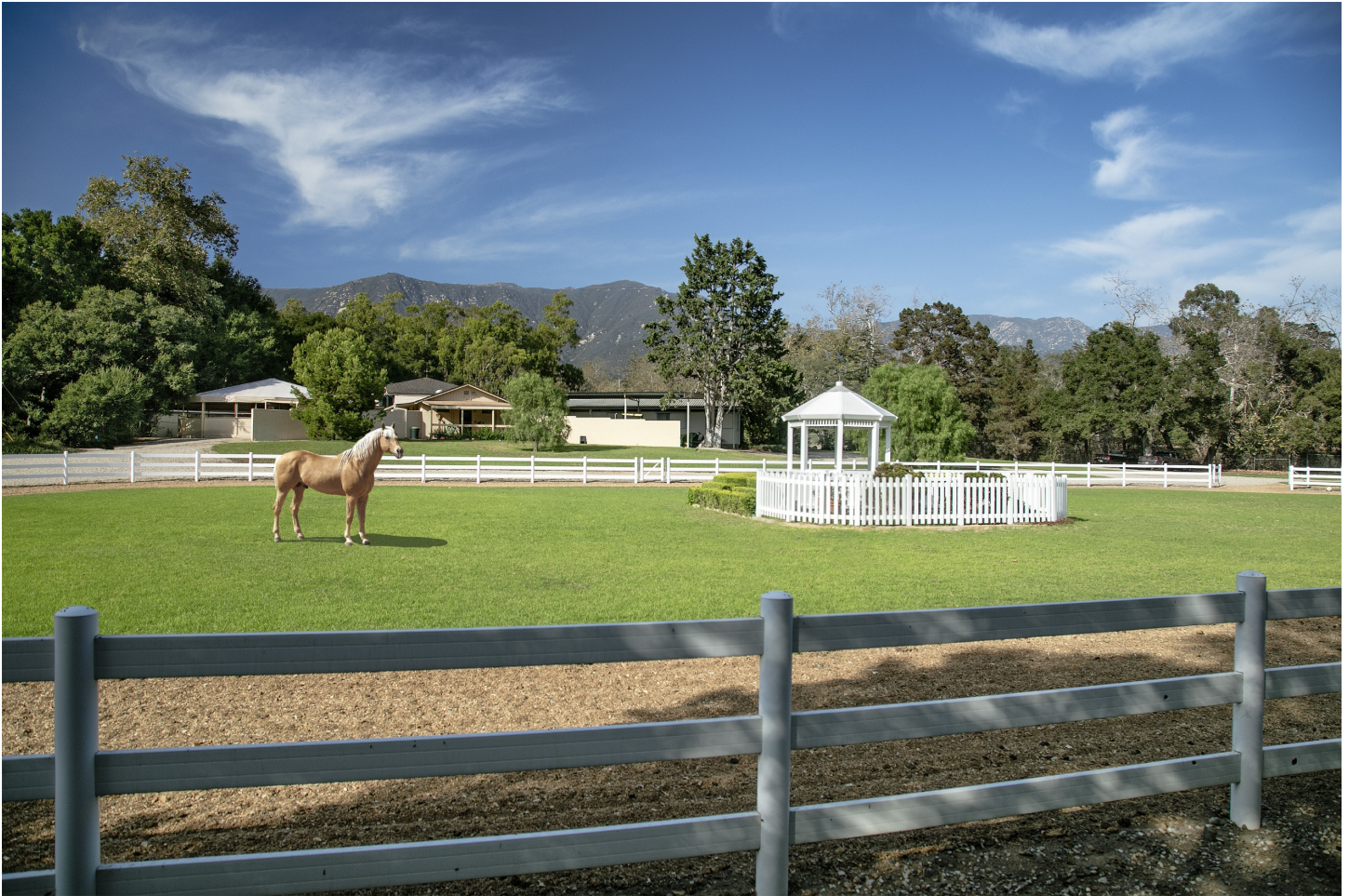
23 Acre Seamair Farm, Recently Purchased by Oprah Winfrey